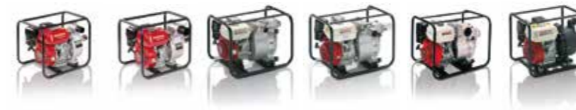
Model WB 20† WB 30† WT 20† WT 30† WT 40† WMP 20