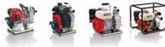
Model WX 10 WX 15 WH 15† WH 20†*