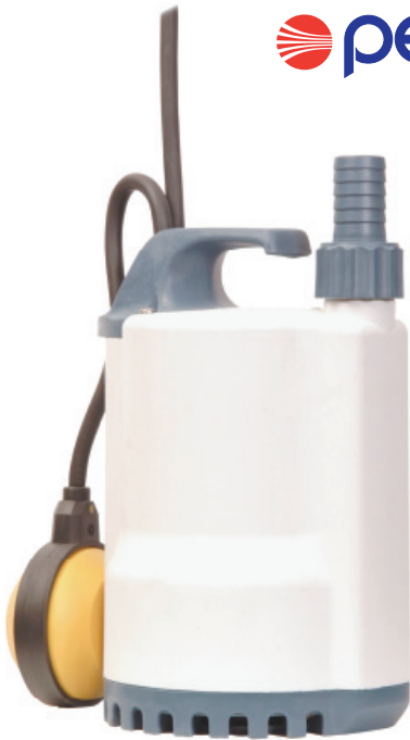
TOP 1 automatic