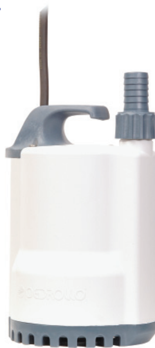
TOP 1 manual