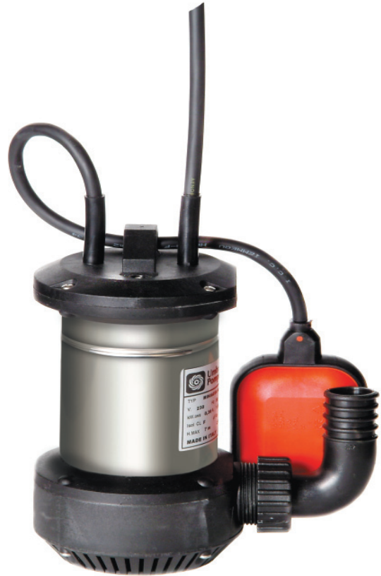
Mini 400 automatic