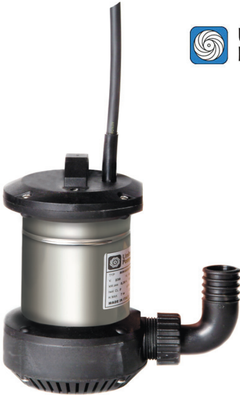
Mini 400 manual